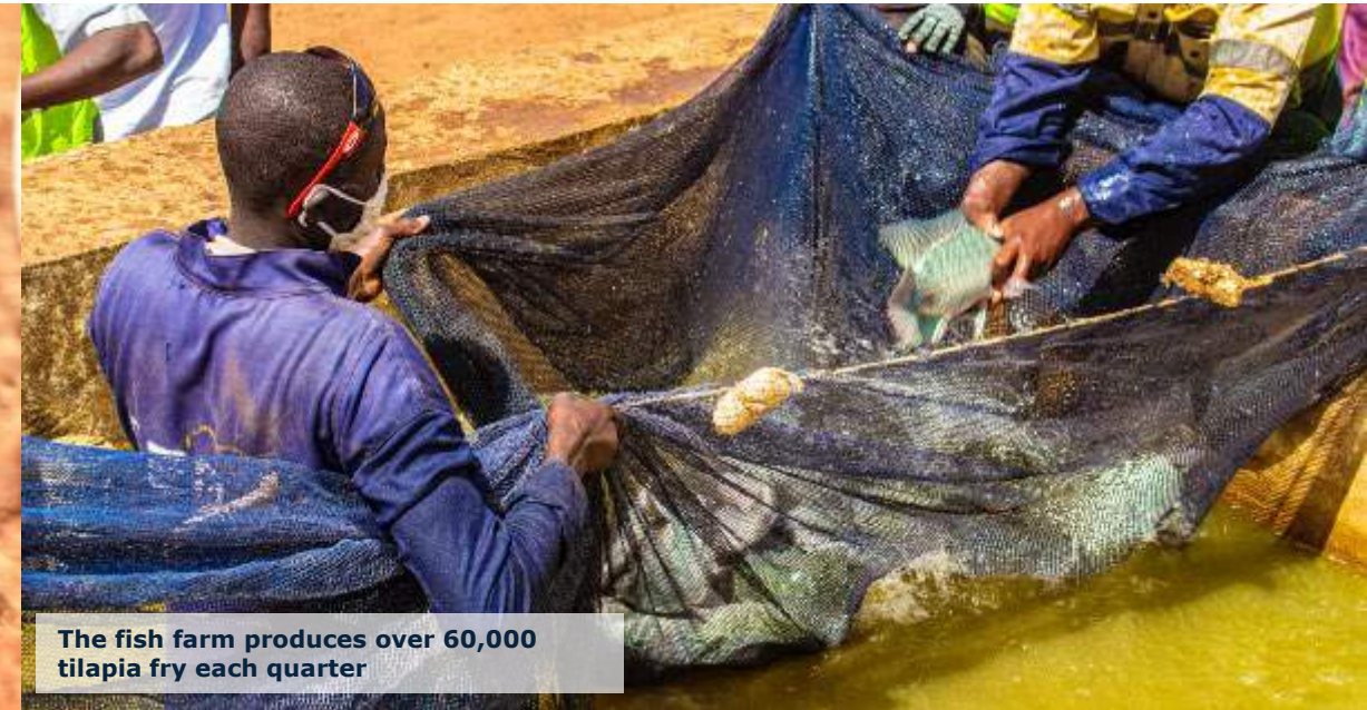
The fish farm produces over 60,000 tilapia fry each quarter