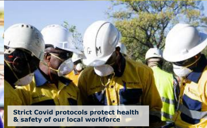
Strict Covid protocols protect health & safety of our local workforce