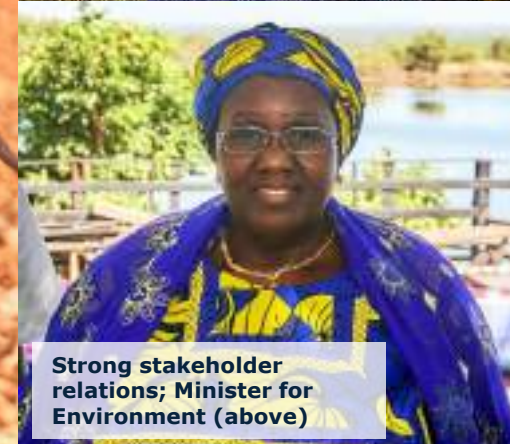
Strong stakeholder relations; Minister for Environment (above)